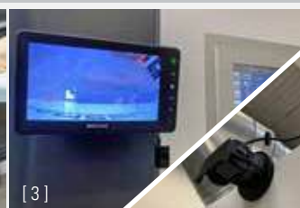
[ 3 ]