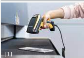
[ 1 ]