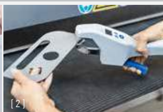
[ 2 ]