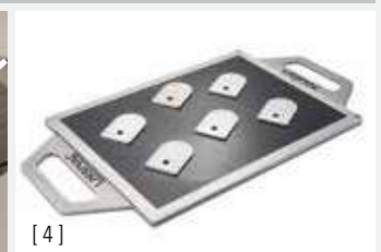
[ 4 ]